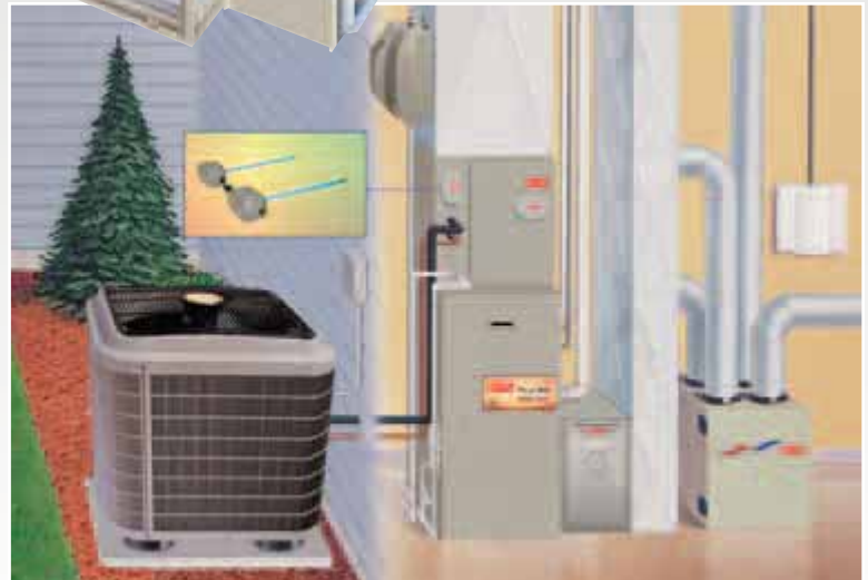
HYBRID HEAT® Deluxe Heat Pump and Deluxe Gas Furnace System